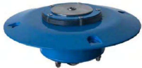
FLUSH MOUNT LIGHTS