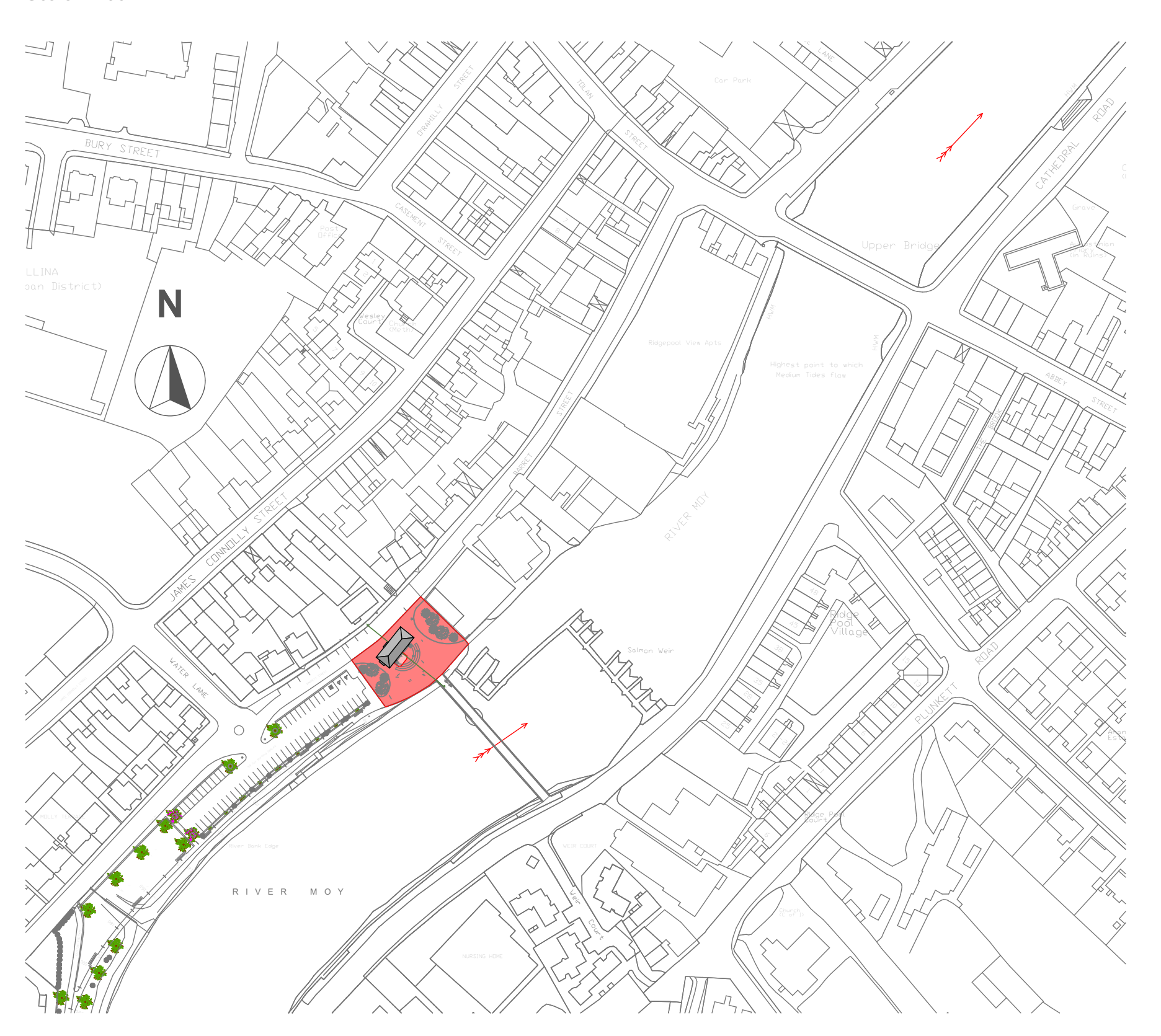
SITE LOCATION MAP - Scale 1:2000