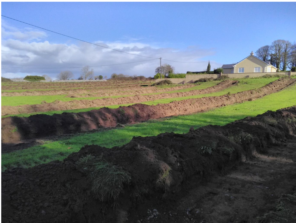
Plate 3 General view of Test trenches looking north-east.