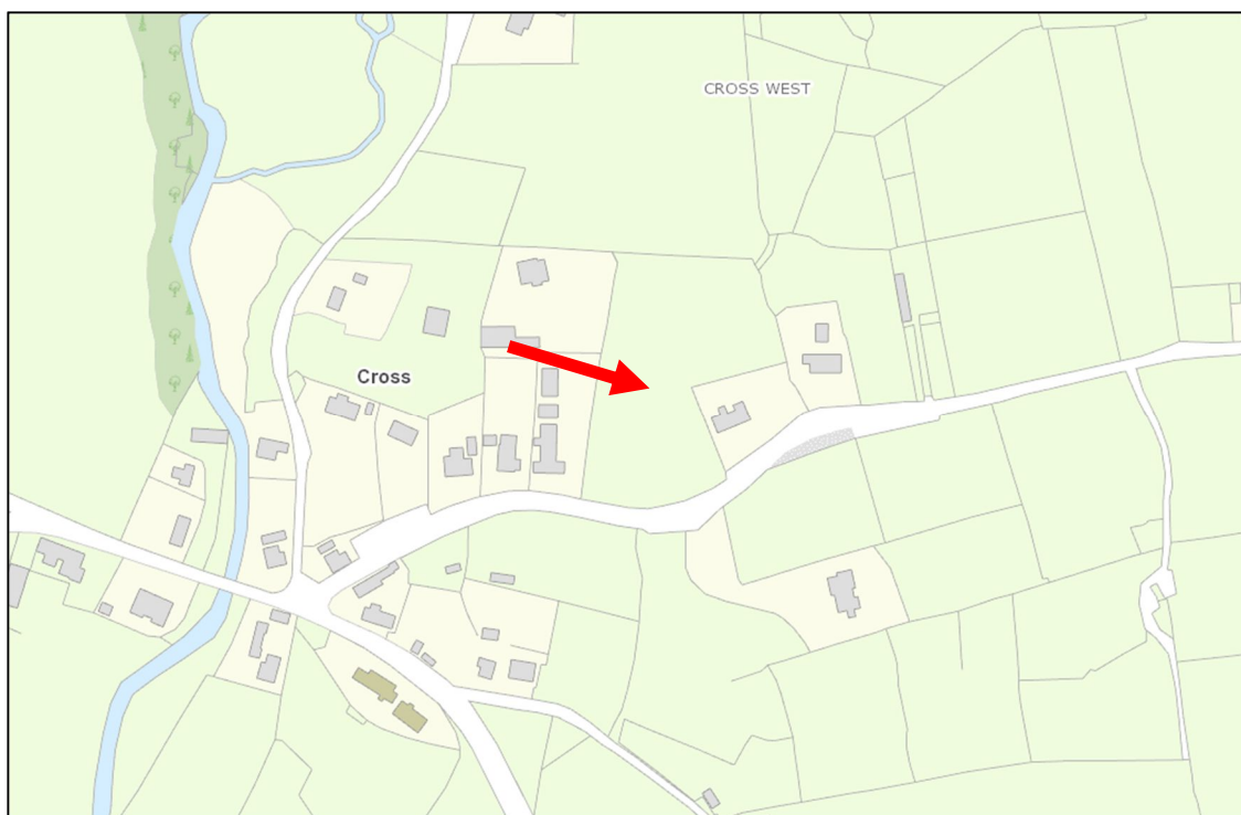
Fig. 1 The development site on eastern outskirts of Cross village, Co. Mayo, arrow points to centre of development site

A total of fourteen test trenches were mechanically excavated across the development site which is 1.1 Ha. in size. Nothing of archaeological significance was uncovered. The results of the testing concluded, no further archaeological mitigation was required, for development to proceed at this site.