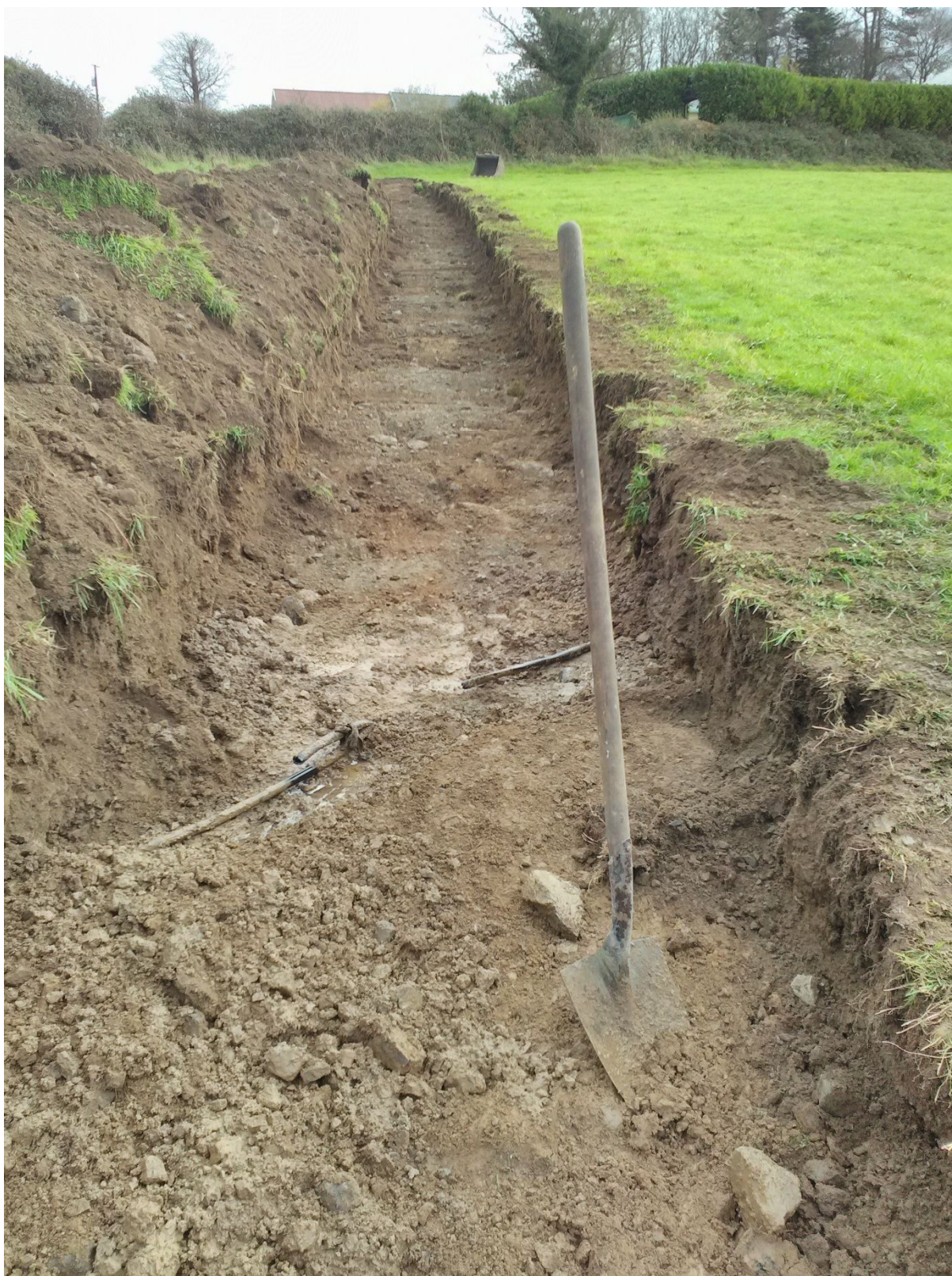
Plate 2 Excavation of Test Trench Two showing gravel (Context 3) and clay (Context 1) and marl (Context 2) above it