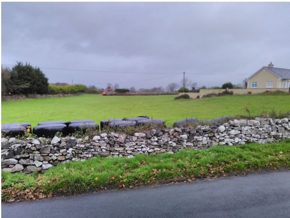
Plate 1 General view of Development Site and excavation of Test Trench Two