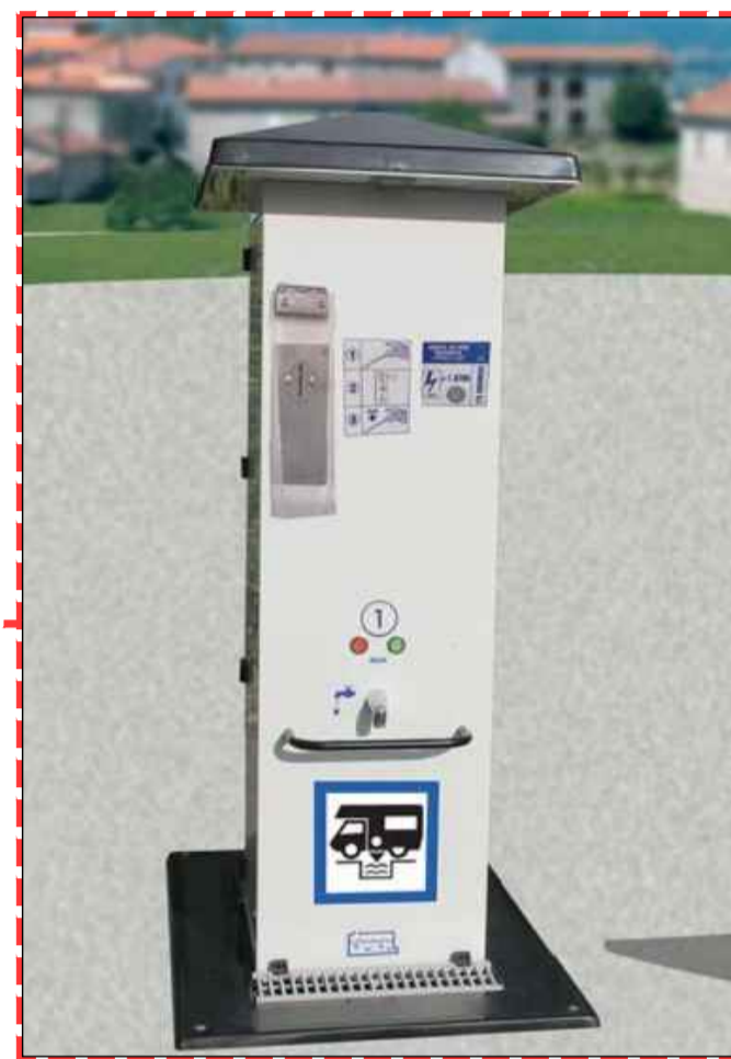
INDICATIVE EXAMPLE OF SERVICE POINTS