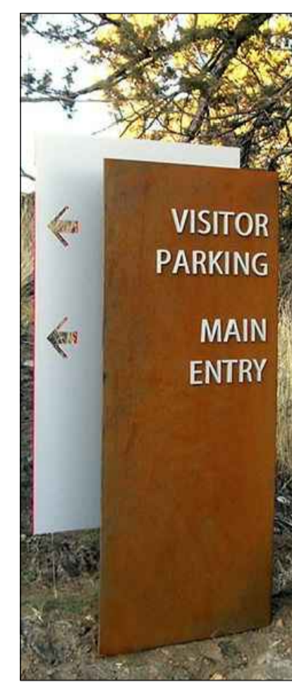
INDICATIVE EXAMPLES OF NEW DOCKS SIGNAGE