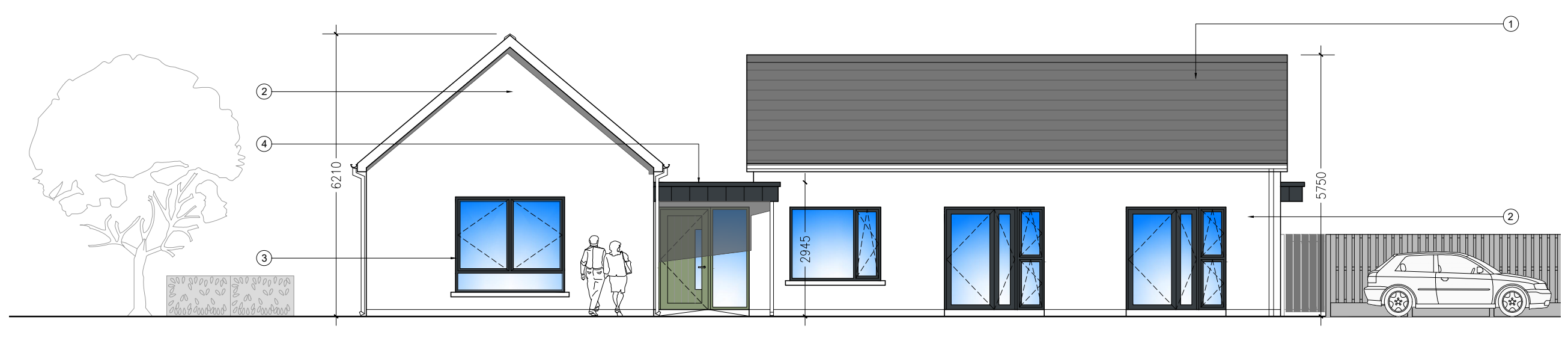
South East - Entrance Elevation Scale 1:100

Conditions of use of this drawing Conditions of use of this drawing note: if this A1 size drawing is reproduced at a smaller size which makes these conditions difficult to read, please contact the Architects for a legible copy of these conditions. 1. This drawing the design and contents contained herein are copyright, all rights are reserved. No part hereof may be copied or reproduced partially or wholly in any form whatsoever without the prior written consent of the copyright owners Rhatigan & Company Architects Ltd. 2. This drawing is to be relied upon only for the specific project purpose and for the specific for which it has been prepared. This drawing is not to be relied upon for construction purposes and no implied or expressed warranty is given as to the suitability for construction purposes unless the drawing is stated to be for construction purposes. purposes. 3. The Client is granted a copyright licence to use this drawing and its contents for the purpose for which the drawing has been prepared. If this drawing has been produced for construction purposes the licence will only be valid for a single constructed reproduction and shall expire once a single reproduction has occurred. Such a licence only passes to the Client on payment of Architects fees in full and in any even the licence cannot be assigned without prior written consent of Rhatigan & Company Architects Ltd.