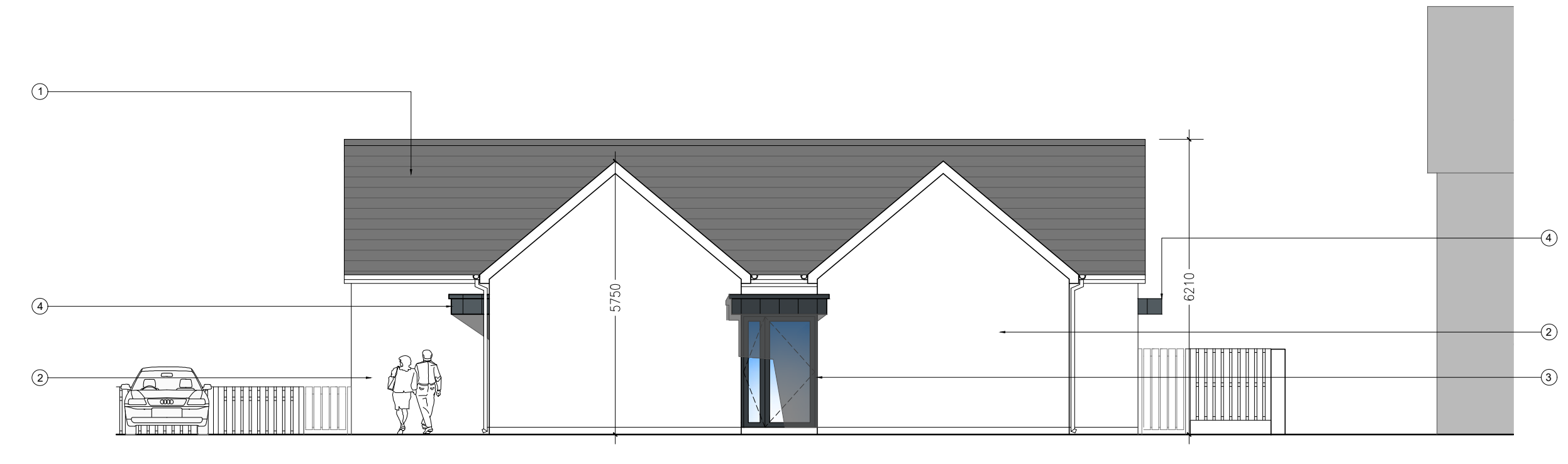
North West - Rear Elevation Scale 1:100