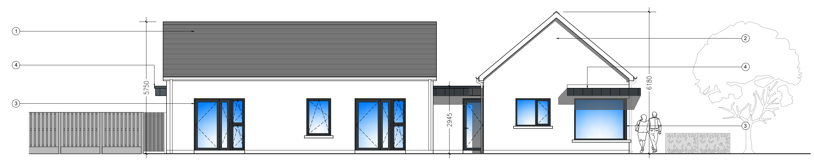
North East - Side Elevation Scale 1:100