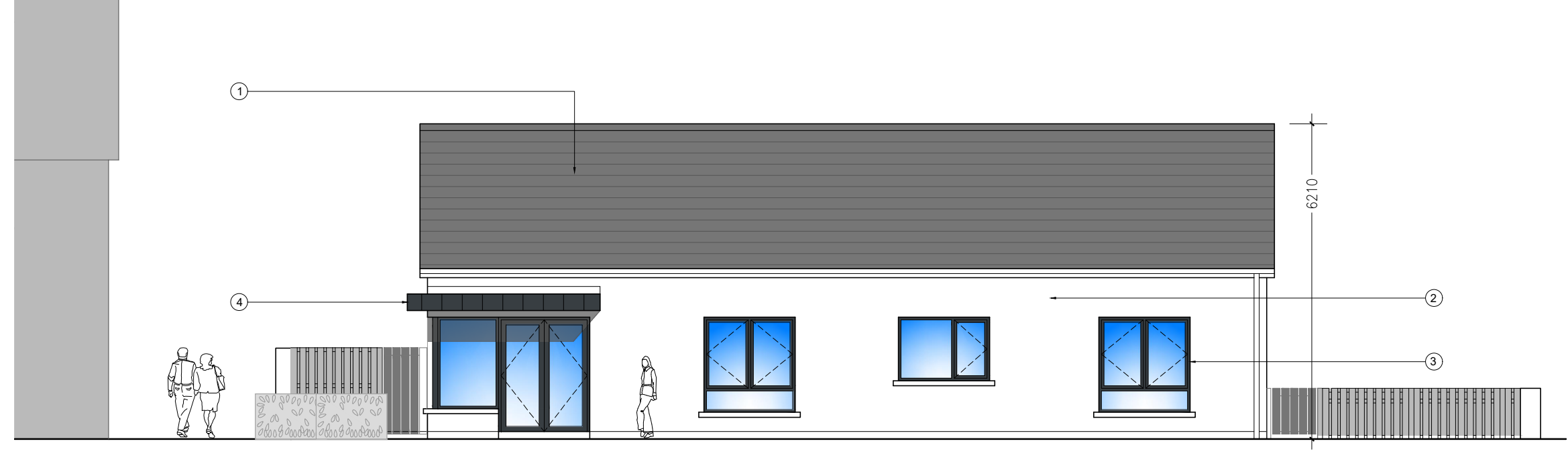
South West - Road Elevation Scale 1:100