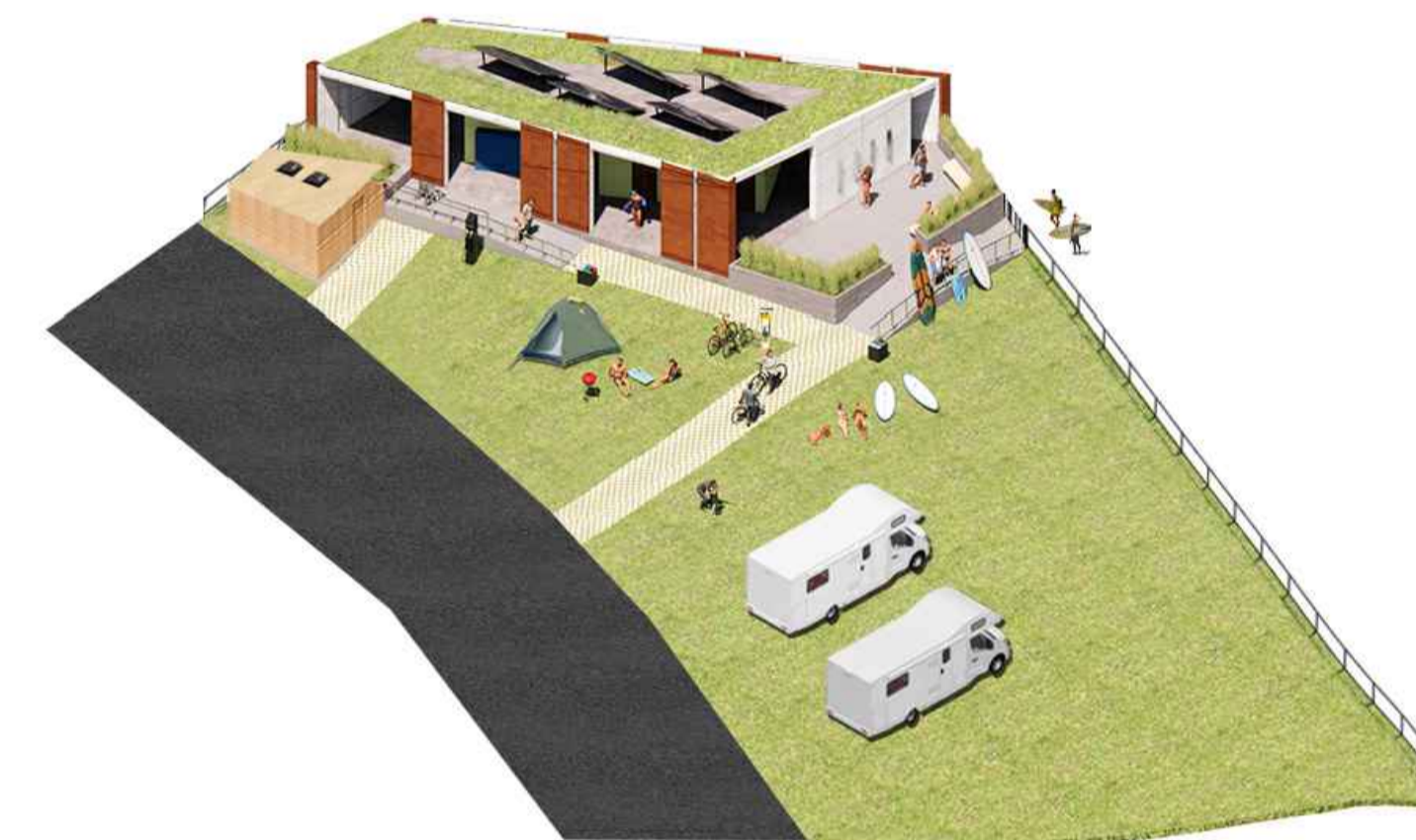
01 Isometric View scale: NTS