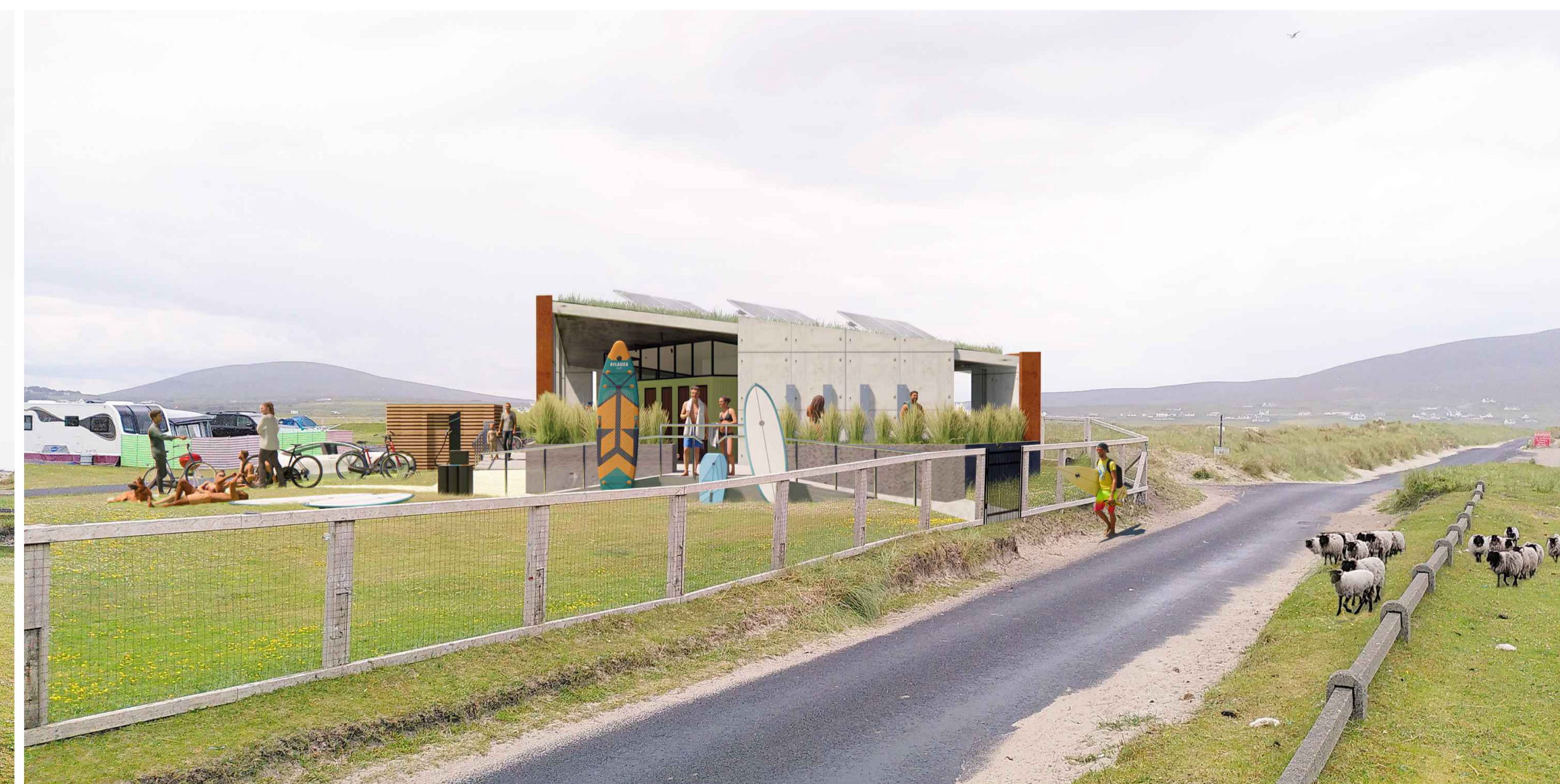
03 South East View scale: NTS