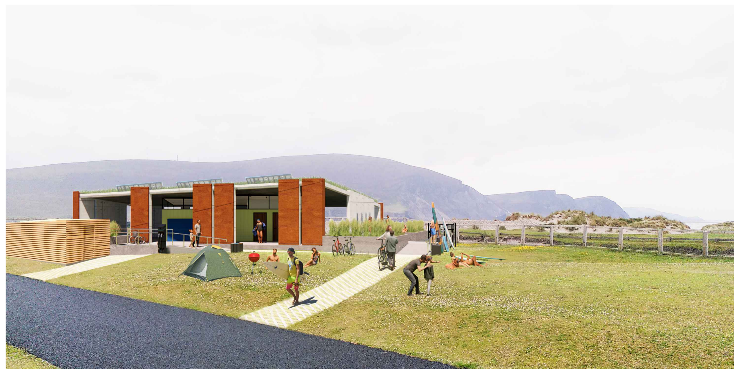
02 North South View scale: NTS