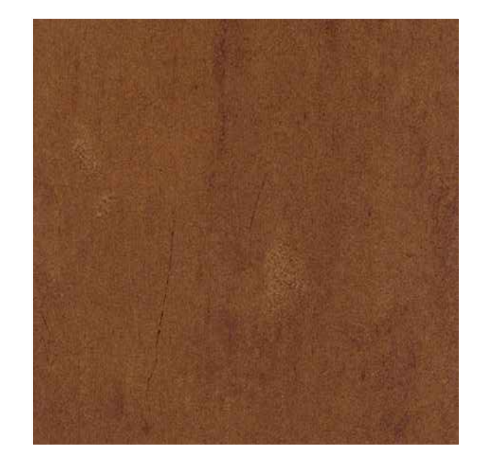
Corten 3mm thick Corten Steel